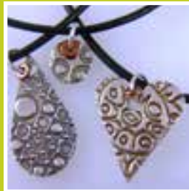
Stunning In Silver April 30