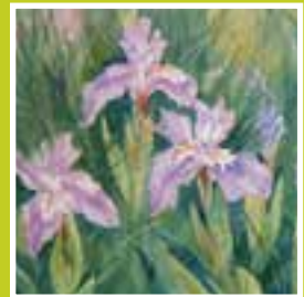
Watercolor May 16

In this class participants will learn a variety of techniques in watercolor including pouring, spattering, textural effects, masking, lifting, stamping and negative painting. A short review of color theory will begin the day. We will then work on several images with a spring theme during the day in order to allow drying time for each. Do not expect to take home a finished piece, but do expect to have fun, learn lots of techniques unique to watercolors, and be inspired to head off on your own watercolor adventure. We will be using watercolor paper and paints, spray bottles, sponges, plastic wrap, salt, masking fluid, toothbrushes, clear contact paper, exacto knives, and the occasional paint brush. Bring a lunch.