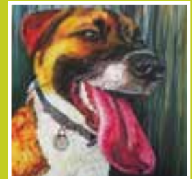
Pet Portraiture March 21