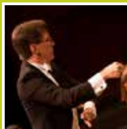
Grand Rapids Symphony Visits Newaygo County See Page 7