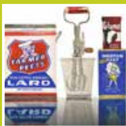
Watercolor Memories by Ferrell Cordle March 30-May 30 Dogwood Lobby Gallery