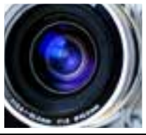
Photography Competition Page 2