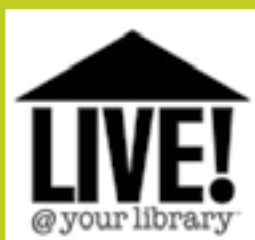
Live @ Library Fremont Library See Page 9