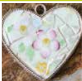
China Pendants April 16