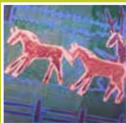
Newaygo County Youth Art March 4 - 26 NCCA-Artsplace and Dogwood Center Lobby Gallery