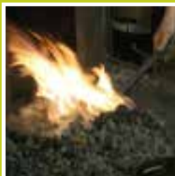
Blacksmith Demonstration Day April 25 See page 5