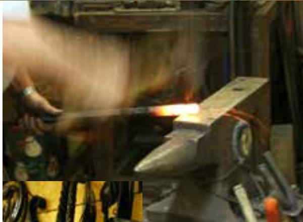
Exhibit: Michigan Artist Blacksmith Association March 30 - May 2 Reception and Demonstration Saturday, April 25 10:00 a.m. - 1:00 p.m.

Jansma Gallery at NCCA-Artsplace, 13 E. Main St., Fremont, 231-924-4022.