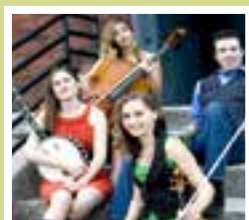
April 17 Harpeth Rising