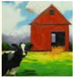
Art Uncork'd Red Barn with Cow March 31