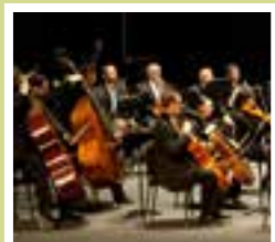
April 1 Grand Rapids Symphony