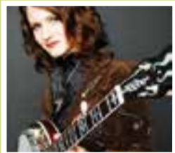
March 21 Songs of the Fall