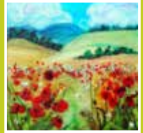
Felted Landscape May 2

Come and explore the art of needle felting with instructor Judy Grant. In this class you will learn the basics of needle felting using layers of rich wool roving colors. Each person will be given a choice of an 8"x10" floral landscape with poppies or flowers in a vase still life. After completing your design you will add interest using beads and creative stitching. Bring a lunch. No prior experience is necessary to thoroughly enjoy this class. Class size limited. Please specify either still life with vase or floral landscape when registering for this class.