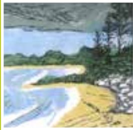
Exploring Printmaking April 18