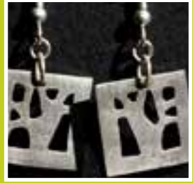
Metalsmith Earrings April 20, 27

In this class jewelry artist, Casey Bemis, will guide you through the process of using metalsmithing skills to design your own unique earrings. Be prepared to use tools to hammer texture into your metal, use cold connections, cut shapes and then use appropriate findings to put your pieces all together. Each person should expect to complete two to three pairs of earrings. Check out Casey's jewelry at the NCCA-Artsplace.