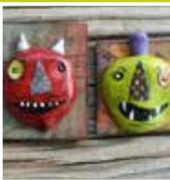
Spring Break Drop In Art April 9, 10 and 11