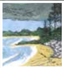
Classes Page 10

Non-Profit Org. U.S. POSTAGE PAID Fremont, MI 49412 Permit No. 8