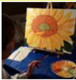
Art Uncork'd Sunflower April 30