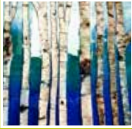
Birch Bark Collage April 20, 27