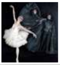
"Swan Lake" Page 6