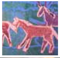
Youth Arts Month Page 4