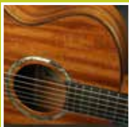
Luthier Exhibit through March 2 Dogwood Center Lobby Gallery